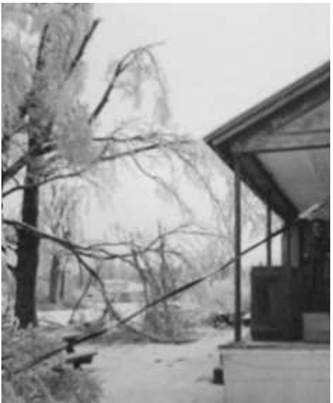
A view in front of our house. Notice the brush under the trees and the electric wire going to the house.

Sunday afternoon Luke and I figured it is safe to go into the woods so we walked up to the cabin we are building. As I was walking up the road, I went past the lane. I didn't see it at first because of all the trees and