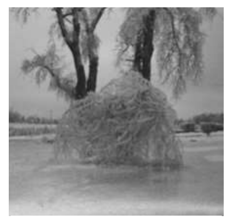
An overloaded willow tree in our front yard.

One neighbor used to call us Bible thumpers and seemed suspi-