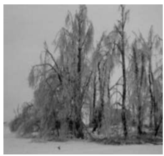
Some sad looking basswood trees.

I walked behind the barn and stood looking at the woods and the big maples in the pasture. A loud bang and I saw a big limb from one of them crash to the ground followed by tinkling ice. There was almost a constant sound, sometimes farther off, in one direction then another. This is the second day we have been hearing this and the rain isn't over. What will be left of our woods? How many thousands of dollars worth of