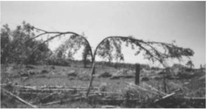
An elm tree that split down the middle. This tree lived 5 years after the ice storm.

Driving restrictions were gradually being lessened. First, they began to allow people to go to a local store for supplies, and then they allowed travel in