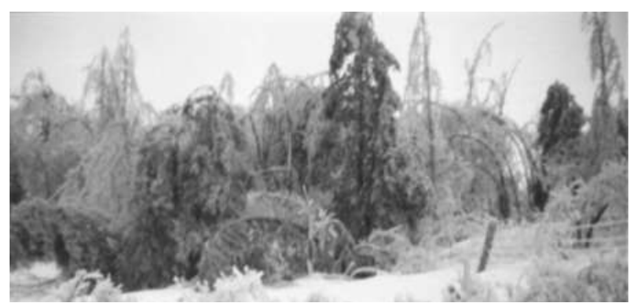
A view of the woods during the ice storm. Winter 2004

The next morning it was Friday, 22 F., and another rainy day. I took a walk to look around. The willow tree in the yard, which stood about 15 ft. (Continued on page 12)